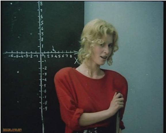
Fig. 2. The frame from the film The Doll (1988)

A shot from the movie The Doll (1988) reflects the appearance, clothing, physique of the character-teacher of "perestroika" years.