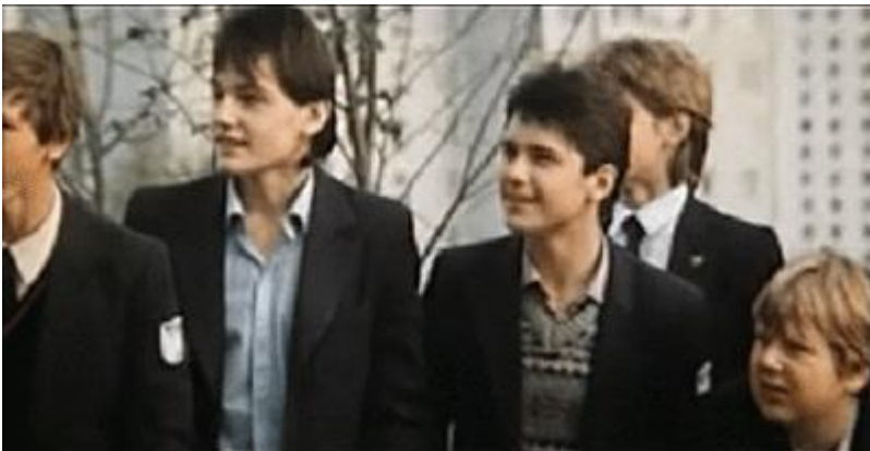
Fig. 1. A frame from the film Non Slap in the face (1987)

A frame from the film Non Slap in the face (1987) gives an idea of the appearance, clothes, physique of the characters – students of the era of "perestroika".